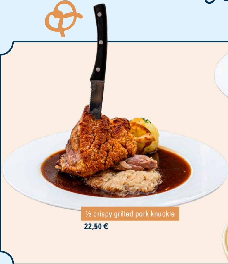
1/2 crispy grilled pork knuckle 22,50 €