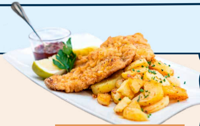
„Wiener Schnitzel“ escalope of veal 32,90 €