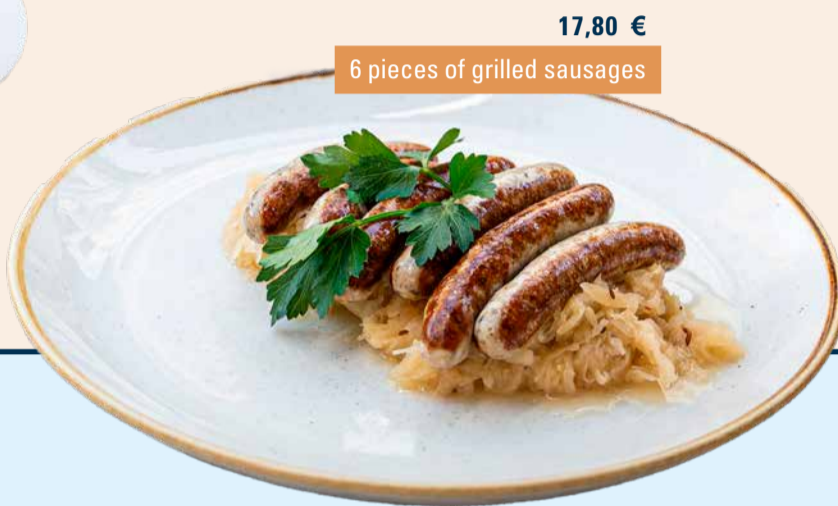
17,80 € 6 pieces of grilled sausages