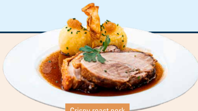
Crispy roast pork (shoulder and belly) from straw pork 16,90 €